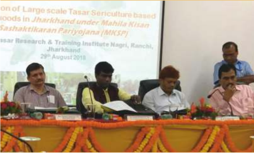
CEO, JSLPS attending Tasar Workshop