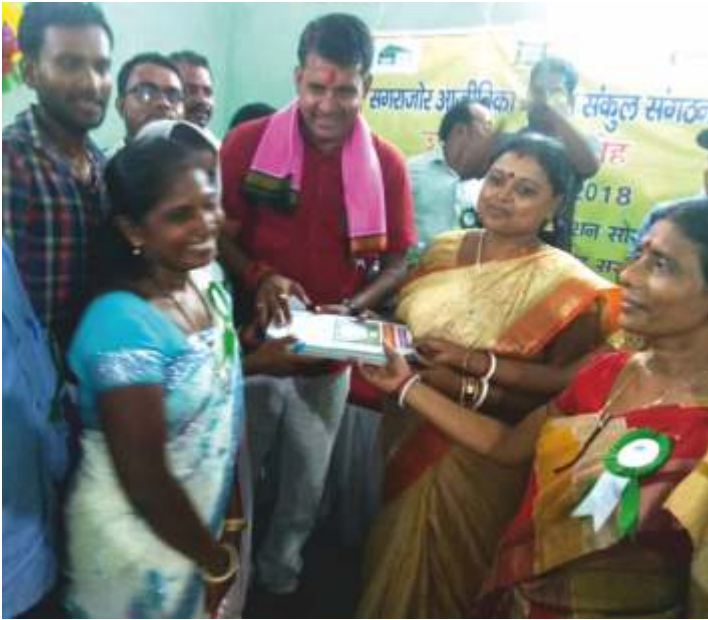
650 SHG Members celebrated its opening

The first Cluster Level Federation (CLF) of Deoghar district in Sagarajor cluster of Palojori block was inaugurated by Agriculture and Animal husbandry Minister Shri Randhir Kumar Singh in the presence of JSLPS staff. About 650 Sakhi Mandal members attended the program.