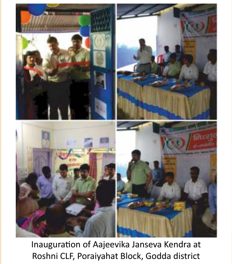
Inauguration of Aajeevika Janseva Kendra at Roshni CLF, Poraiyahat Block, Godda district