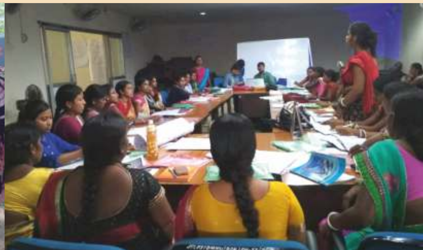
Refresher Training of Bank Sakhis at DMMU Bokaro