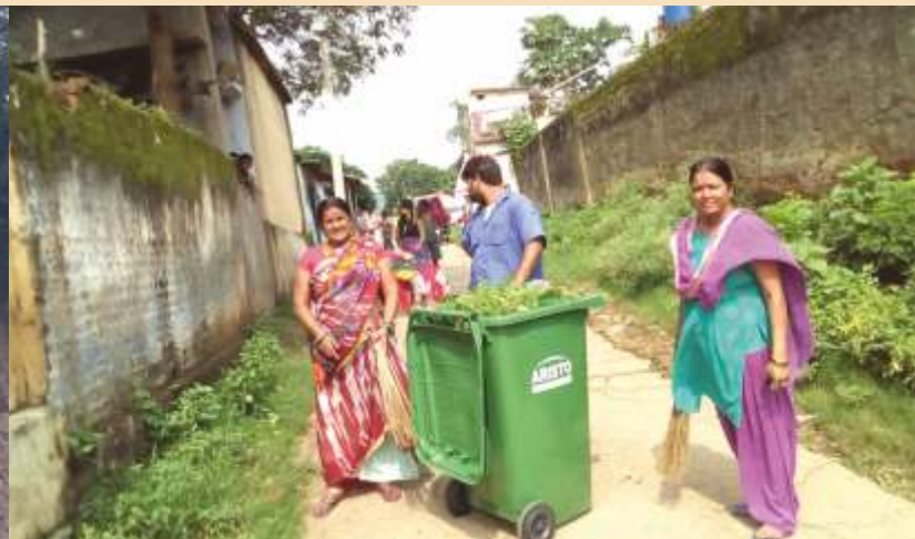
SHG members taking forward SBM in Patratu block of Ramgarh district