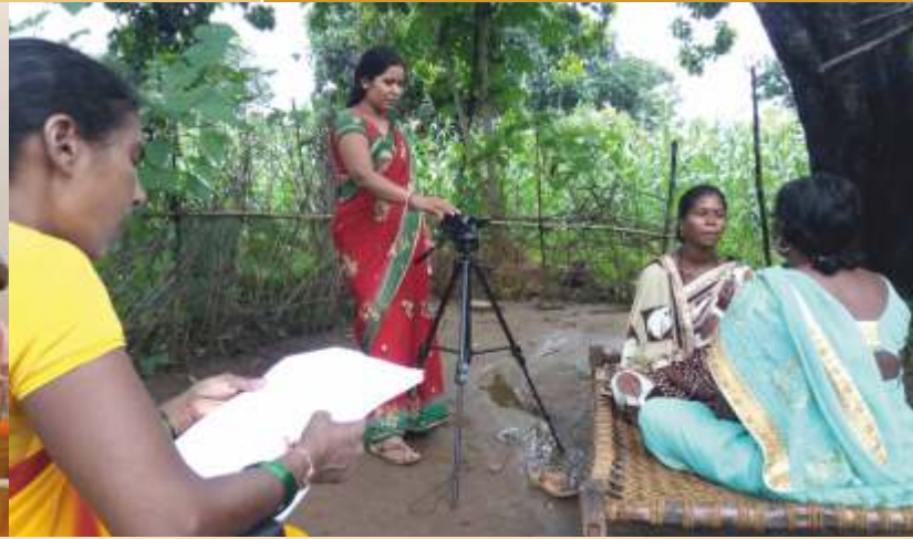
Video production of lemon grass by VCRPs in Palamu district