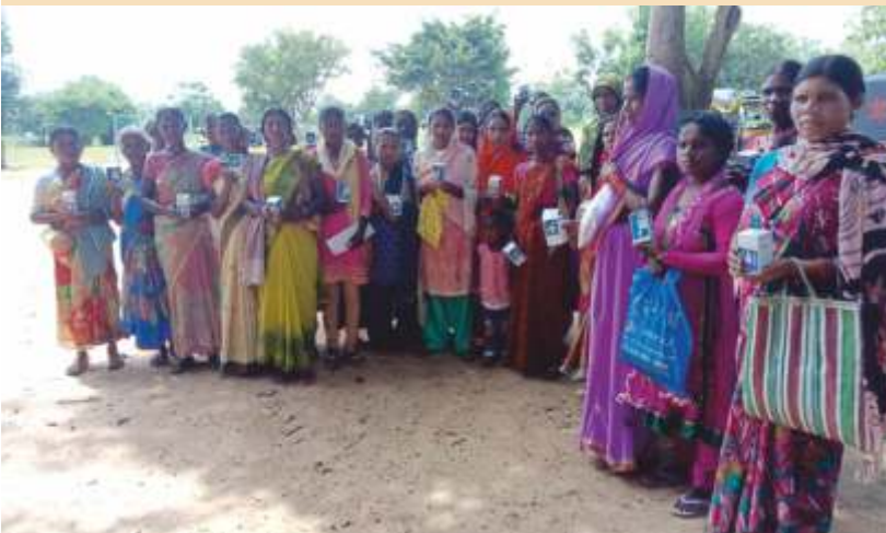
LED Bulb distribution in Bharno Block of Gumla district