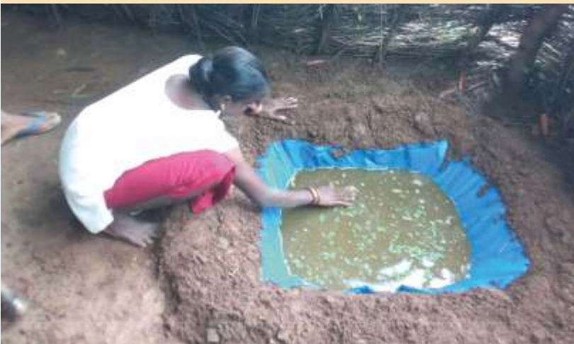
Ajola preparations in Goikera block of West Singhbhum district