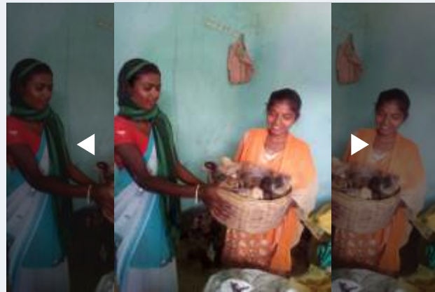
BYD distribution in Ramgarh