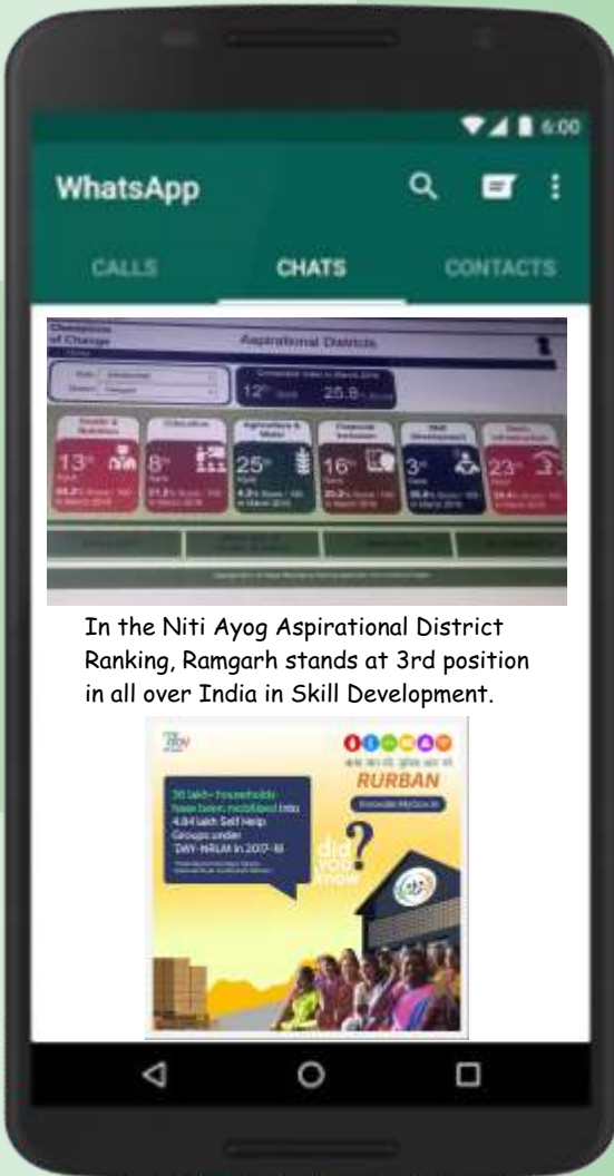
In the Niti Ayog Aspirational District Ranking, Ramgarh stands at 3rd position in all over India in Skill Development.