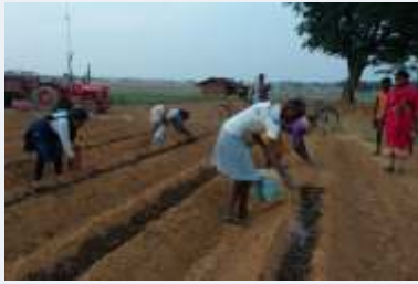
Installation of MDI system at Mahadev Changri village, Bharno, Gumla