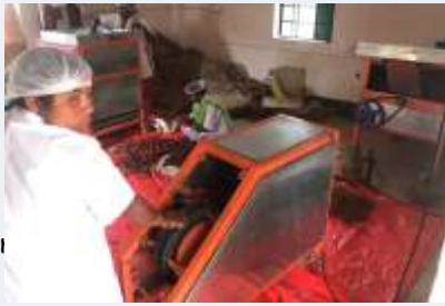
Tamarind Processing Centre at Bila village in Goilkera, West-singhbhu