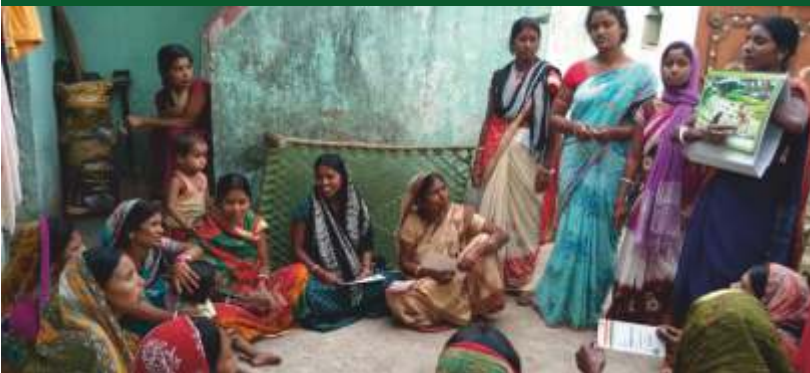
Capacity Building of SHG Members