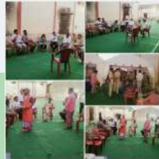
SHG Catering groups providing food services at Pandra Bazar, Ranchi