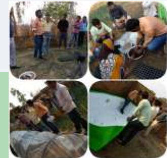
Training of Poly Nursery Installation at Katkamsandi block, Hazaribagh.