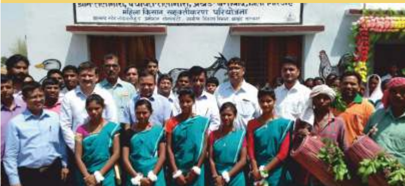
CEO JSLPS and DC Giridih has inaugurated ILDC Bengabad under MKSP.