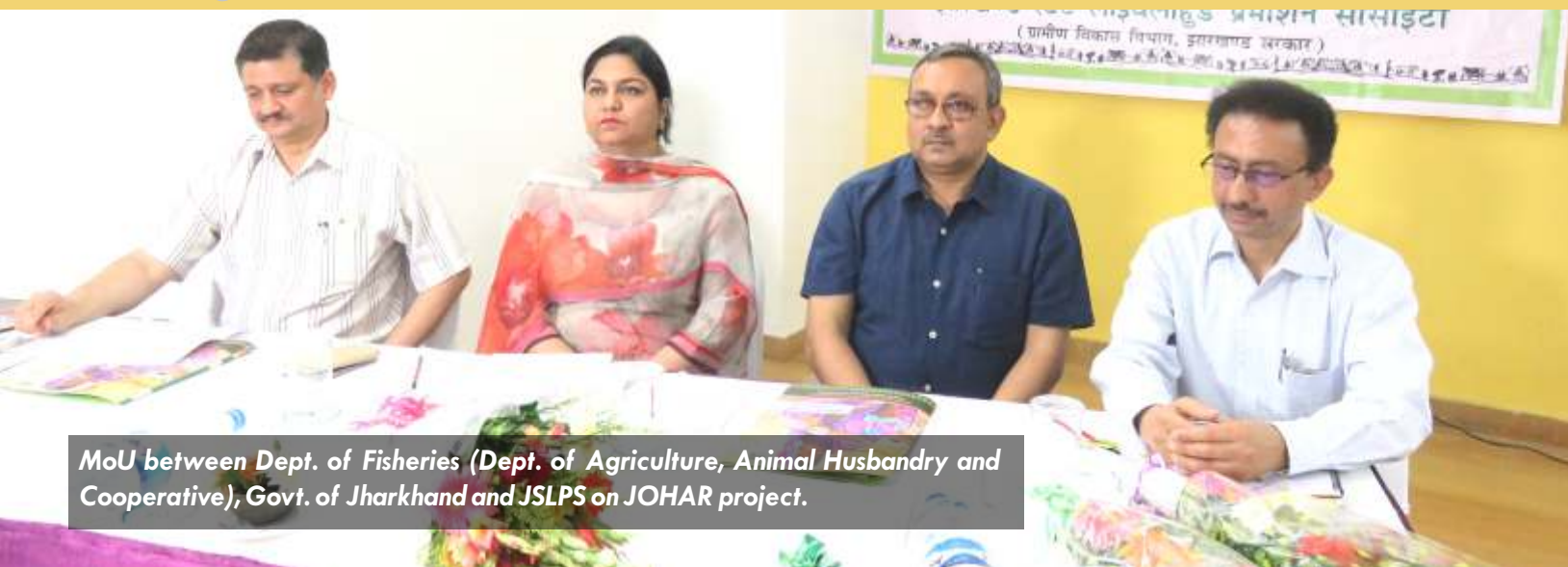
MoU between Dept. of Fisheries (Dept. of Agriculture, Animal Husbandry and Cooperative), Govt. of Jharkhand and JSLPS on JOHAR project.

Taking Financial Inclusion to the Unreached