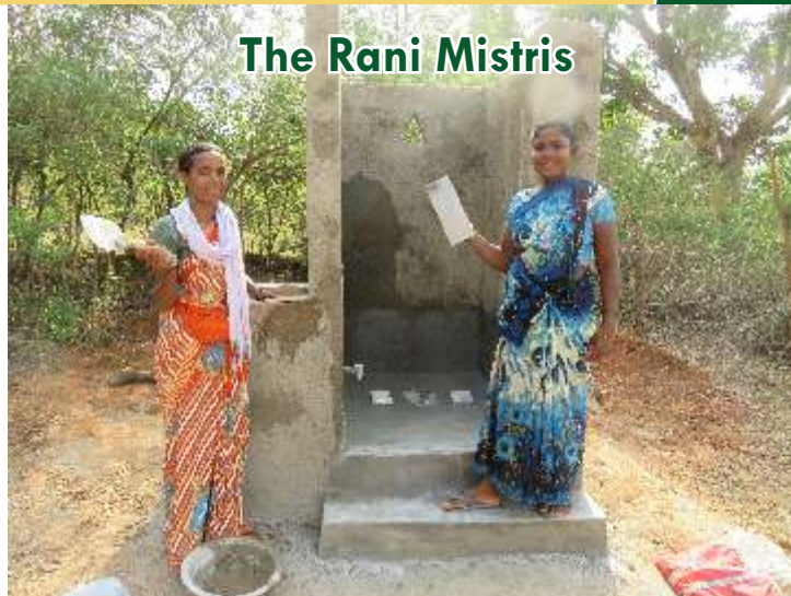
Women in Jharkhand are turning Swachh Bharat dream to reality and how!

It was then that the womenfolk took the plunge into the field of construction. Two SHG members in Jaldega block of Simdega district