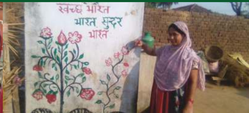
SHG members taking SBM forward