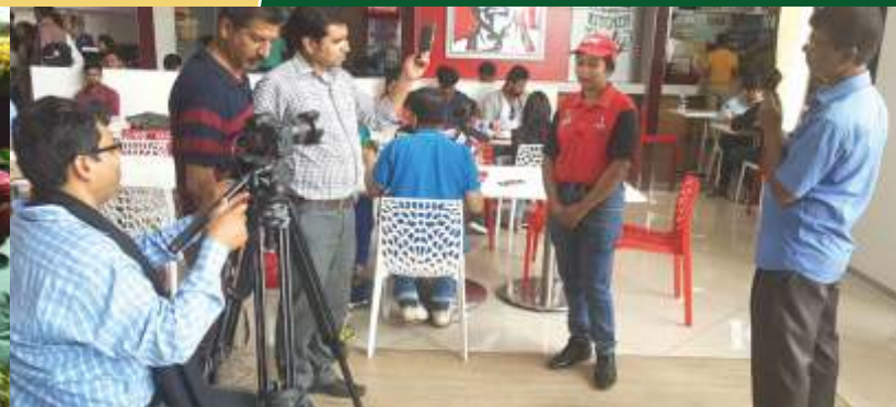
Film Shooting of DDU-GKY